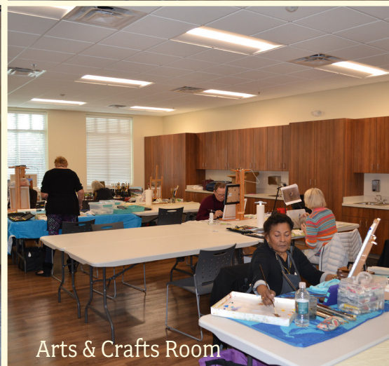
Arts & Crafts Room